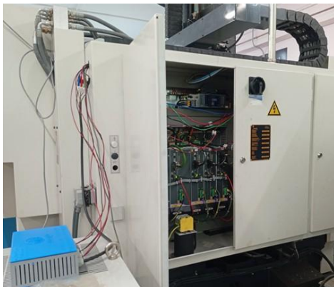
Figure 3 Installation of the EnergID prototype and the PEL103 power quality analyzer in the electrical panel of a milling machine at the Arratiako Zulaibar vocational training center.

The system was tested on a milling machine while milling a metal workpiece. The technical and operational results demonstrated high accuracy.